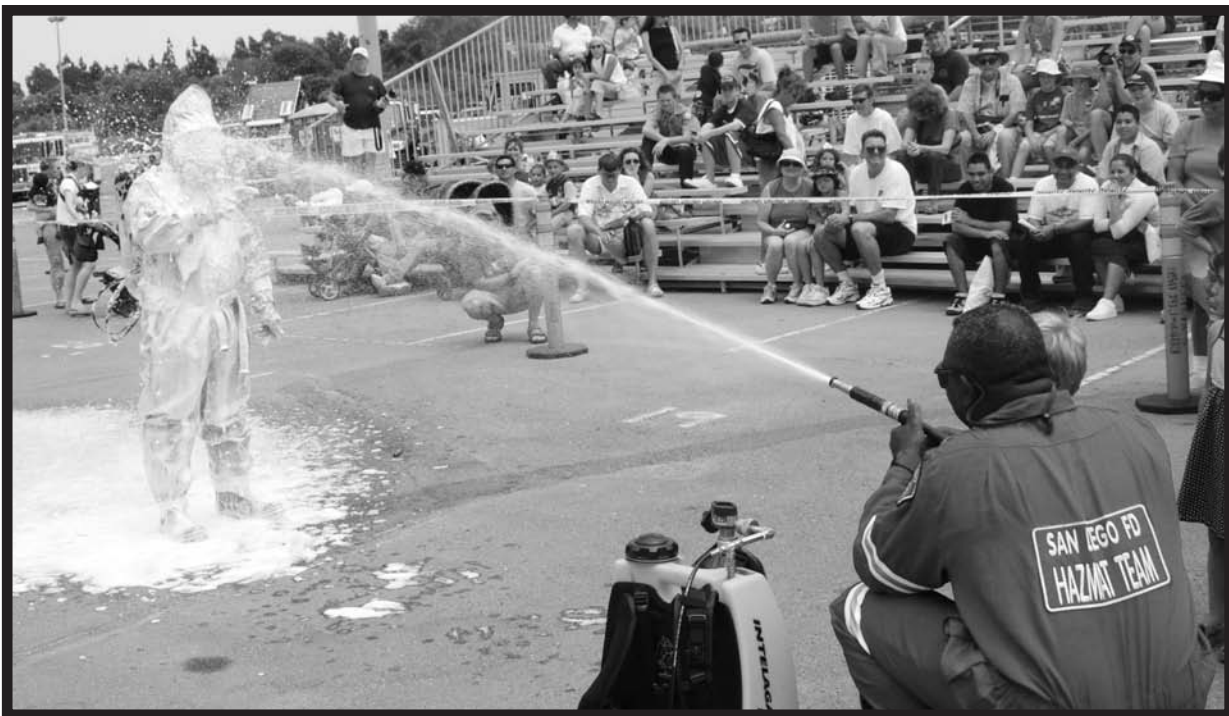
One of the live demonstrations included the San Diego County Hazardous Materials Team. They demonstrated how they decontaminate one of their firefighters after responding to a hazardous materials emergency call.