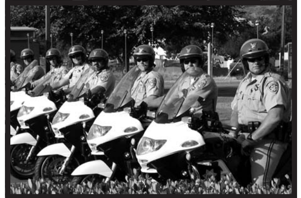
(Top) The most popular FIRE EXPO activity among young children was the hands-on fire hose demonstration set up by the San Diego Rural Fire Protection District.